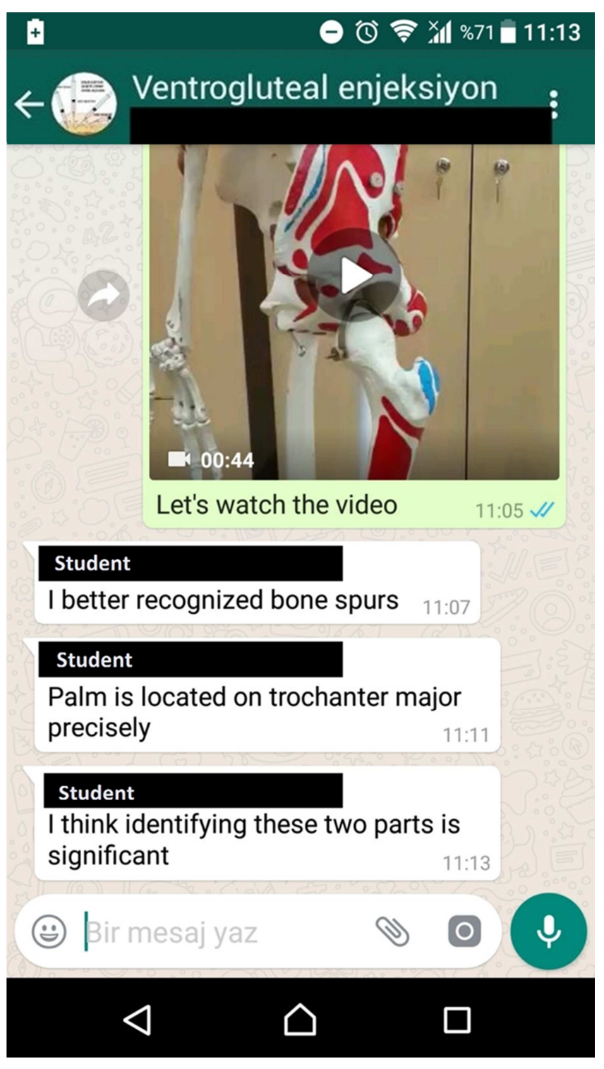
Figure 2 Video share